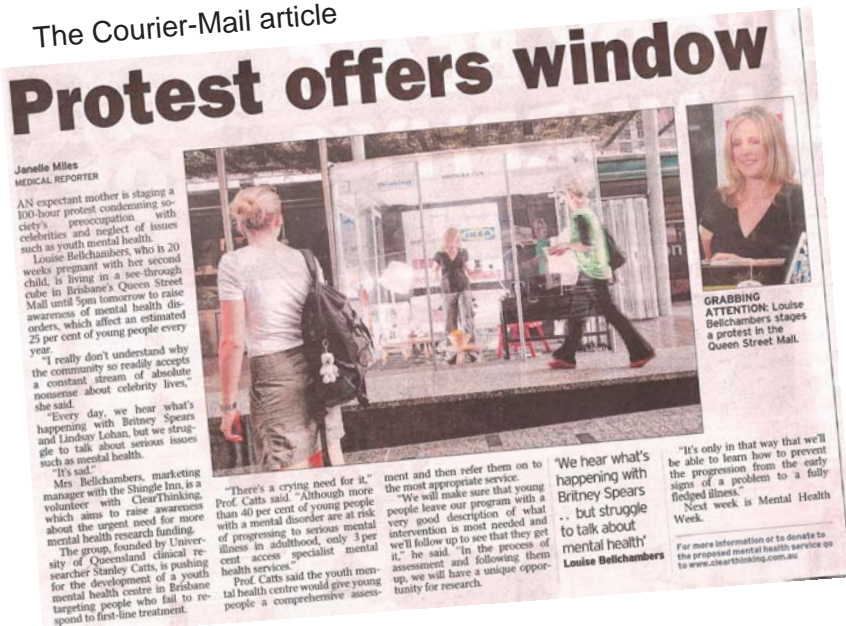
The Courier-Mail article